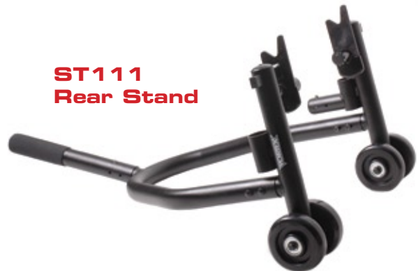
ST111 Rear Stand