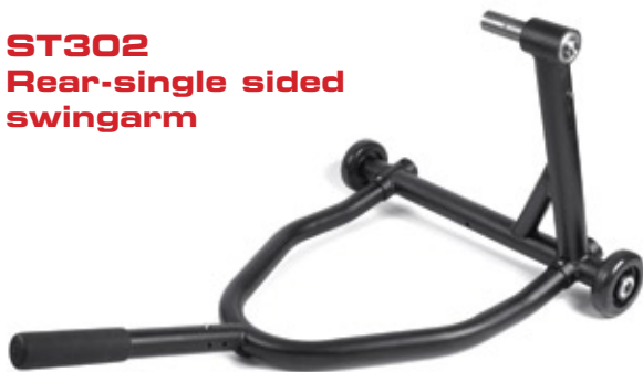
ST302 Rear-single sided swingarm