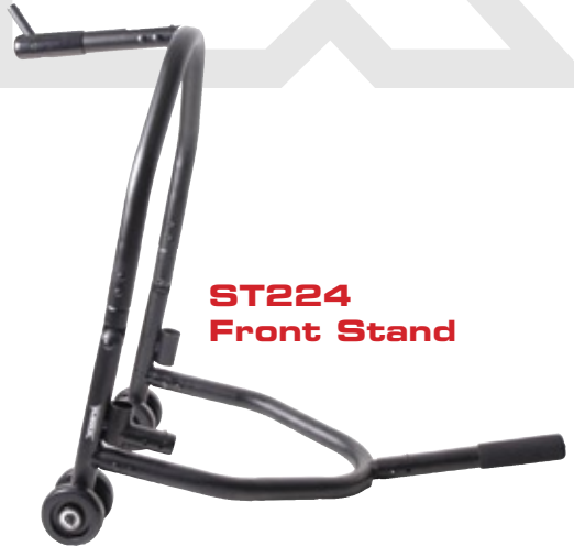
ST224 Front Stand