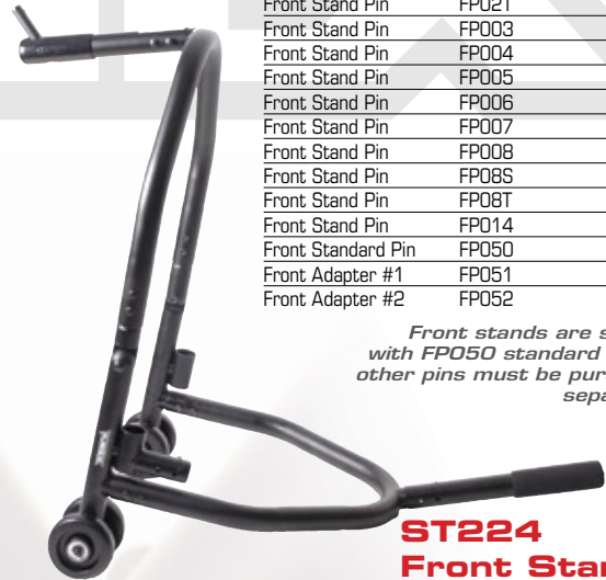
ST224 Front Stand

Front stands are shipped with FP050 standard pin. All other pins must be purchased separately.